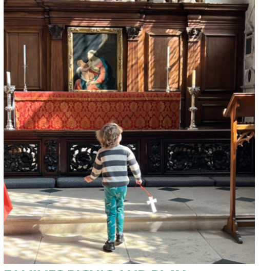
FAMILIES PICNIC AND PLAY Wednesday 2nd August | Florence Park 10.30am - 12.00pm