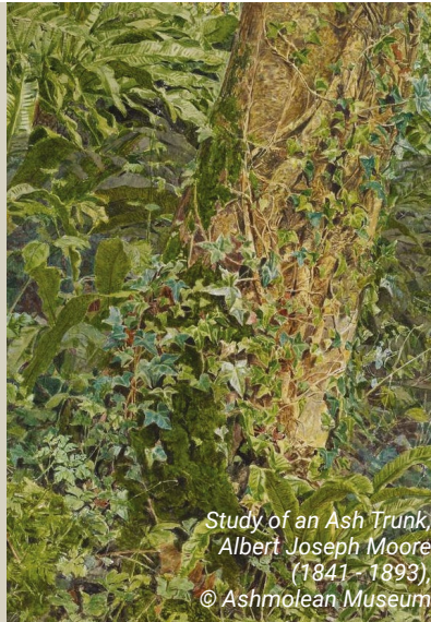
Study of an Ash Trunk Albert Joseph Moore (1841–1893)