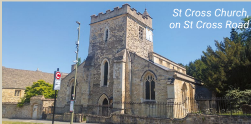
St Cross Church, on St Cross Road

On the weekend of 12th - 13th September, the University Church is delighted to be participating in two exciting local events: Oxford Historic Churches Trust's Ride and Stride , and the Oxford Preservation Trust's Open Doors Weekend . Over the weekend, we have a host of exciting free events for all ages, including tours of the University Church and Holywell Cemetery, the launch of our Equally Oxford Exhibition celebrating local community Groups, and a children's activity exploring the Open Doors theme of 'Everyday Histories: Exploring daily working life through the ages'. We will finish the weekend with Evensong at the nearby St Cross Church, including a sermon by historian the Reverend Canon Professor William Whyte.